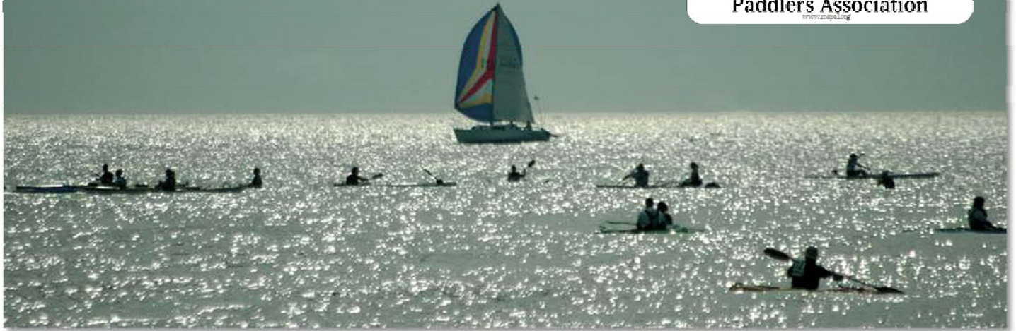
Photo of 11th Annual Paddle for the Bay